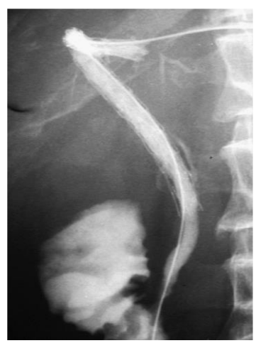
Fig. 2. Self-expandable stent inserted after PTD from the left side.

Conclusion: Our results show that combined radiation therapy could extend the survival in the patients with cholangiocarcinoma obstruction.