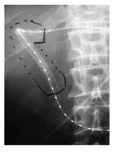
Fig. 3. Brachytherapy planning. The planning guidewire is inserted percutaneously through the stent